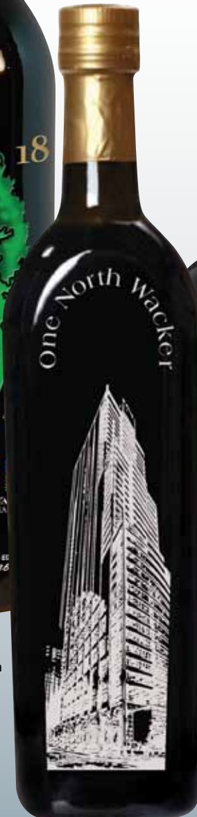
750 ml Organic Extra Virgin Olive Oil 1 Color Etch