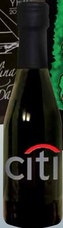
187 ml Sparkling Wine 2 Color Etch