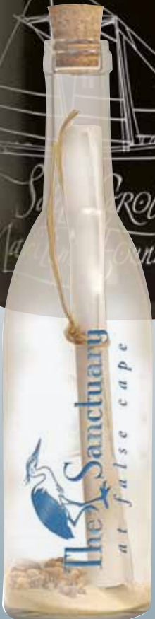
Message in a Bottle 1 Color Etch