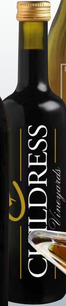
750 ml Balsamic Vinegar 2 Color Etch