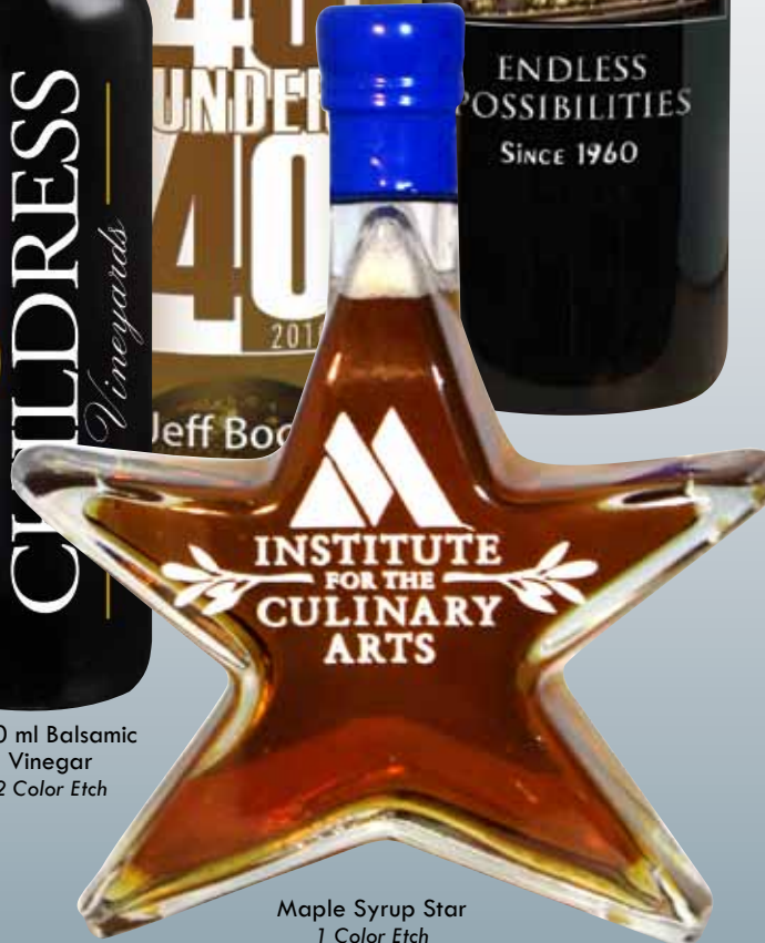
Maple Syrup Star 1 Color Etch

The price list is in effect January 2011 and supersedes all previous pricing.