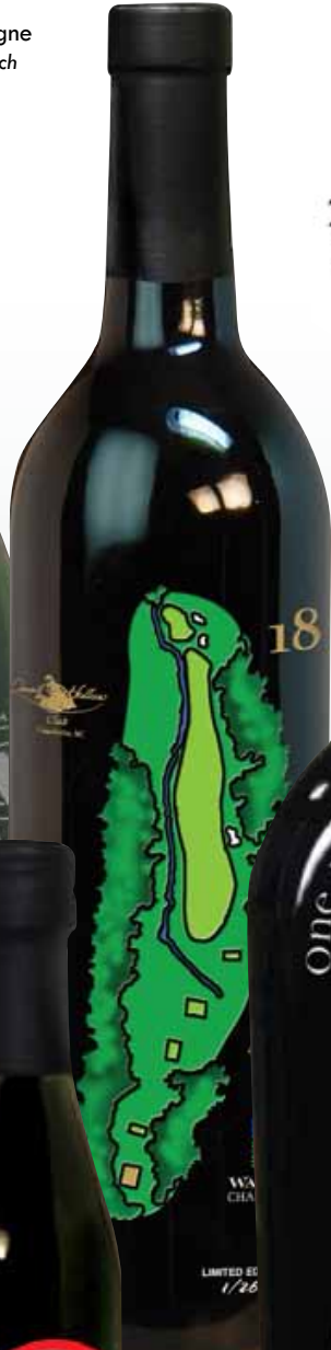
750 ml Cabernet Sauvignon Signature Golf Hole

2010 COUNSELOR® PRODUCT DESIGN AWARD WINNER Awards Category Organic Olive Oil